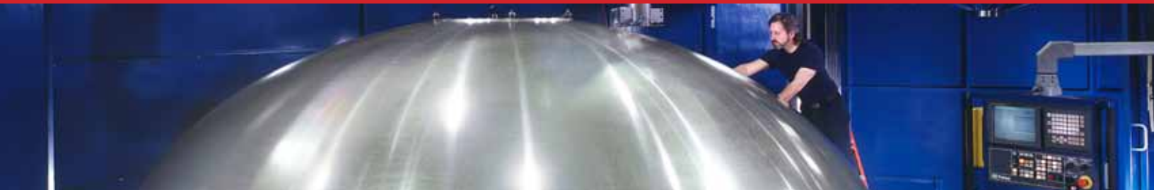
Vertical Turning/Milling Centers